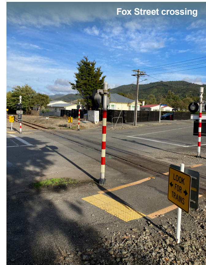
Fox Street crossing

The Bell and Fox Street crossings have similar risk profiles, and only one needs to close to meet safety requirements.