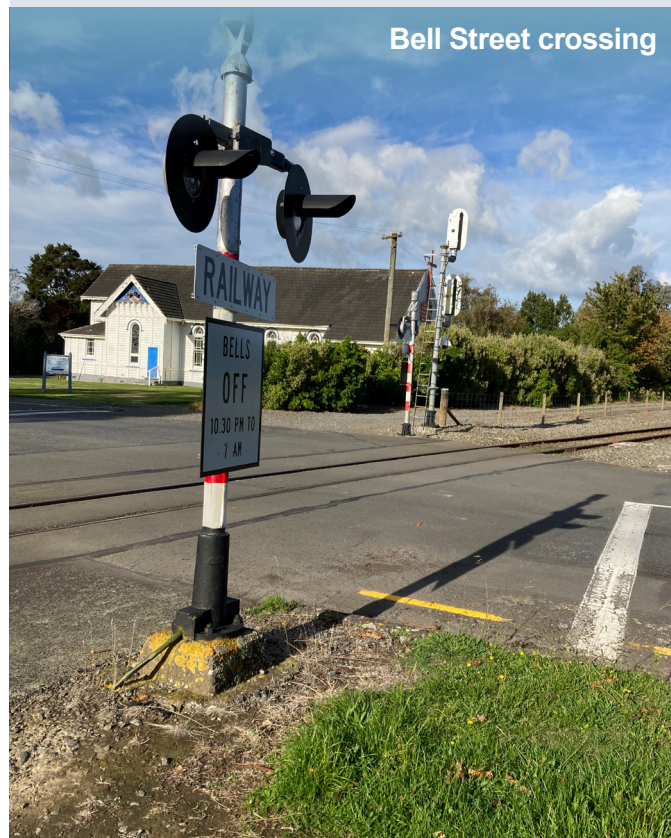
Bell Street crossing

The original proposal was to close the Fox Street level crossing and keep Bell Street open. This option was suggested because it was more in keeping with the town centre Master Plan.