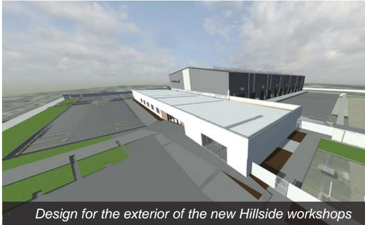
Design for the exterior of the new Hillside workshops