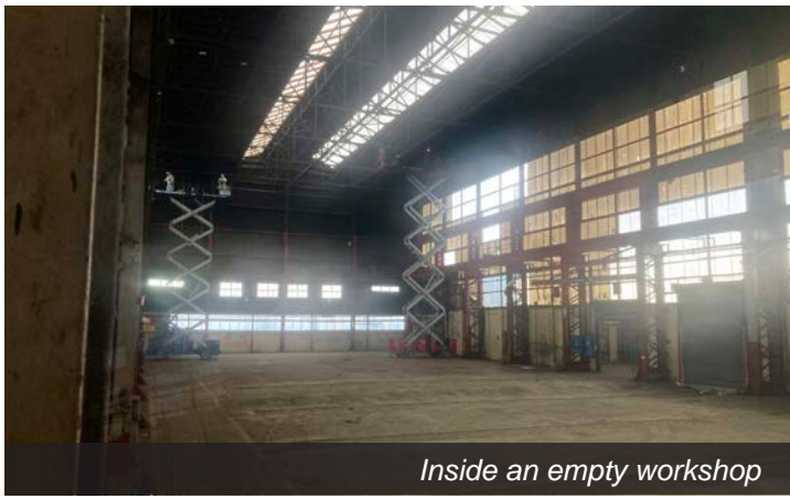
Inside an empty workshop