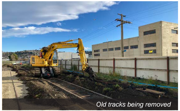
Old tracks being removed