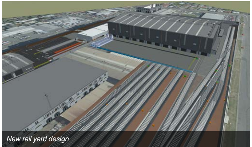
New rail yard design