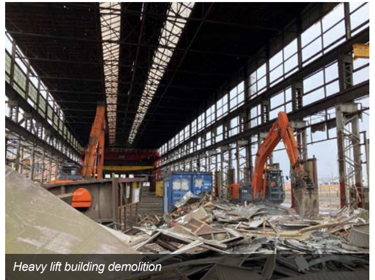
Heavy lift building demolition