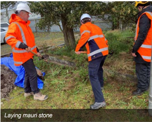
Laying mauri stone