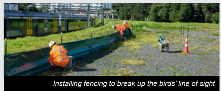
Installing fencing to break up the birds' line of sight

KiwiRail worked with an ecologist to encourage the birds to relocate ahead of the nesting season. Following a site assessment, bunting and fencing were installed to break up sight lines and discourage the birds.