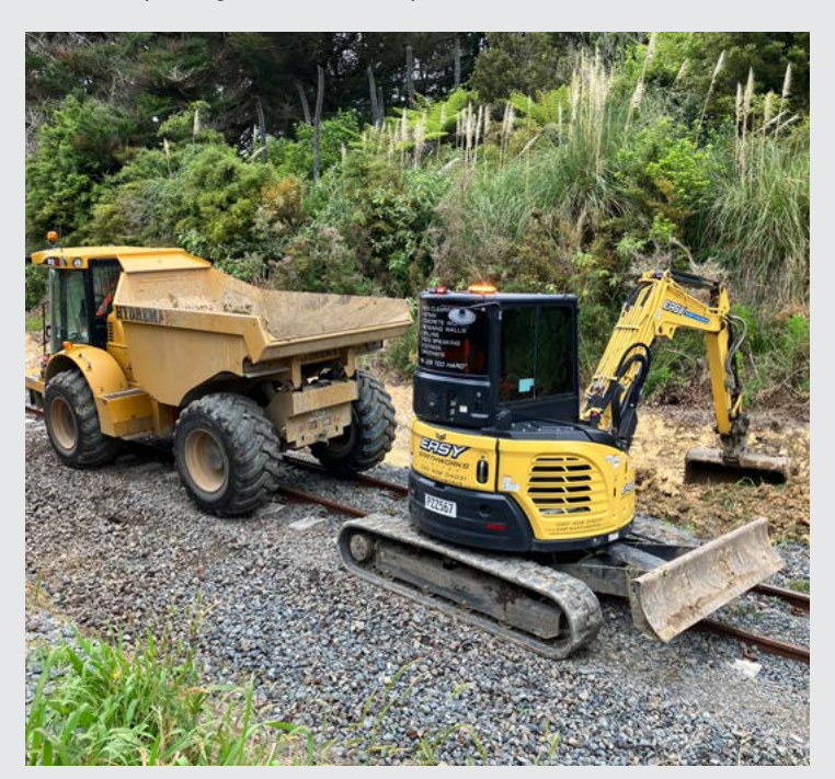
A swale drain being cleared near Maungaturoto.