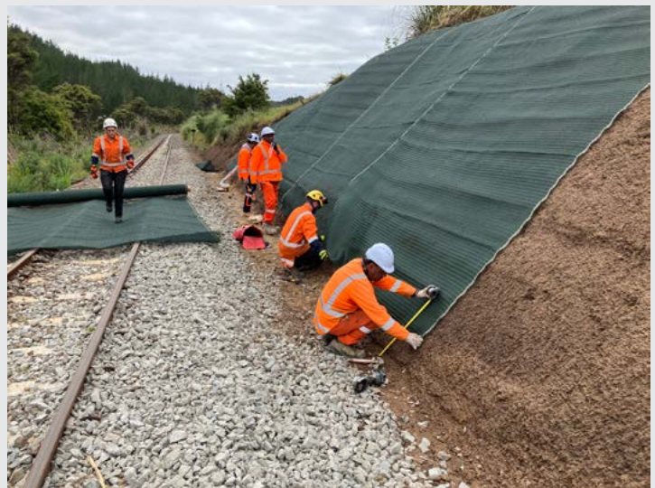
Stabilising mesh being added to a cleared embankment beside the track near Topuni.

The massive Tahekeroa slip, where 35,000 cubic metres of earth fell close to 400 metres across the road and rail line, was completed in September. Two other large slips in the area were also remediated.