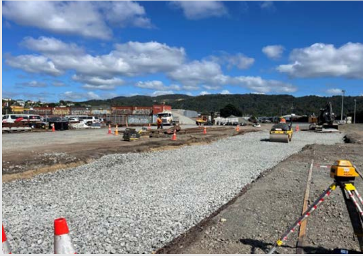
Upgrades to the Whangārei Rail Yard – old track foundations have been dug out and removed, geo-mesh put down and new rock laid. It is then compacted before the rails and track structures are reinstalled.

Resilience improvement work on the NAL will be carried out at the same time as the weather damage repairs.