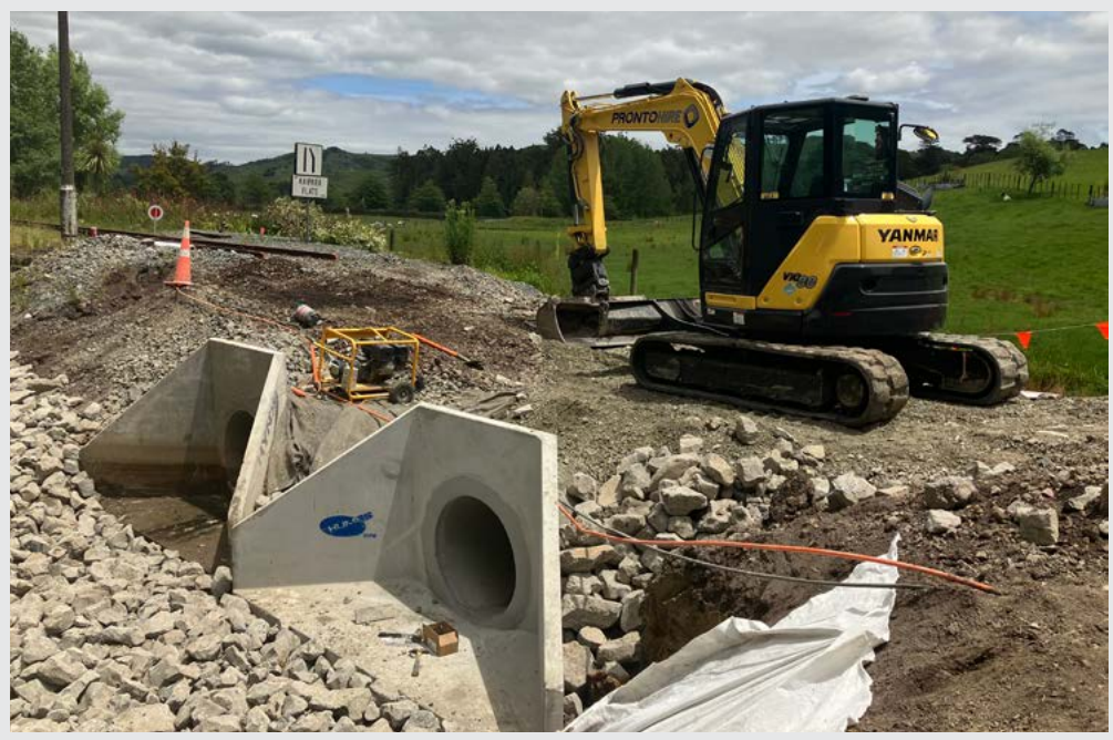
New culverts, to improve water flows, being installed under the rail line in the Kaipara Flats area.

Repairs have been completed on 40 minor/moderate sides and work continues on another 70 minor/ moderate sites. The work is being done by 7 contractors, covering 15 construction packages.