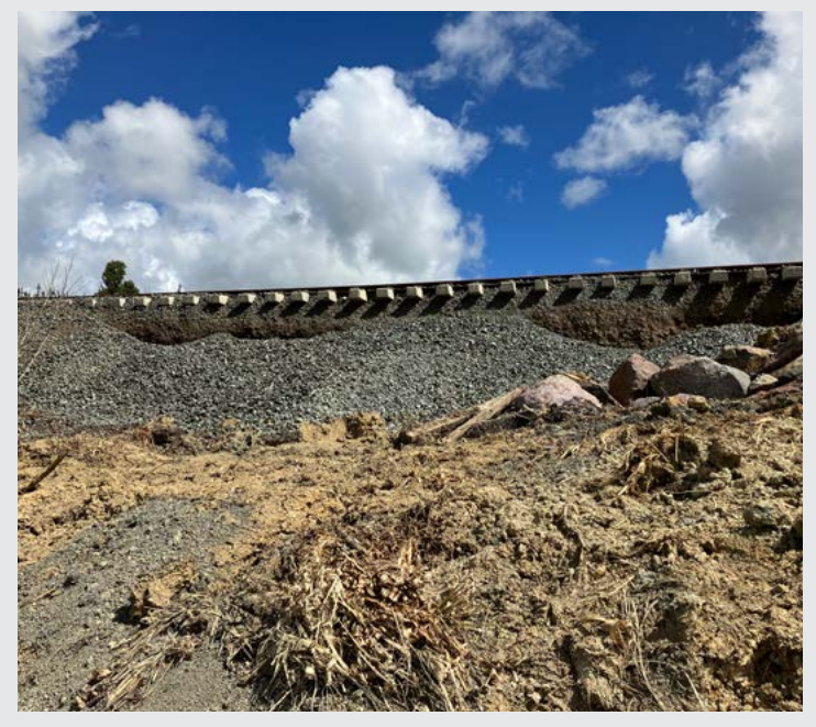
A major damage site near Topuni, which will be worked on over the Christmas break. Land under the rail line has collapsed and the entire 47 metre high slope will need to be retained, along with a new, larger culvert.

For any queries, email us at northlandrail@kiwirail.co.nz