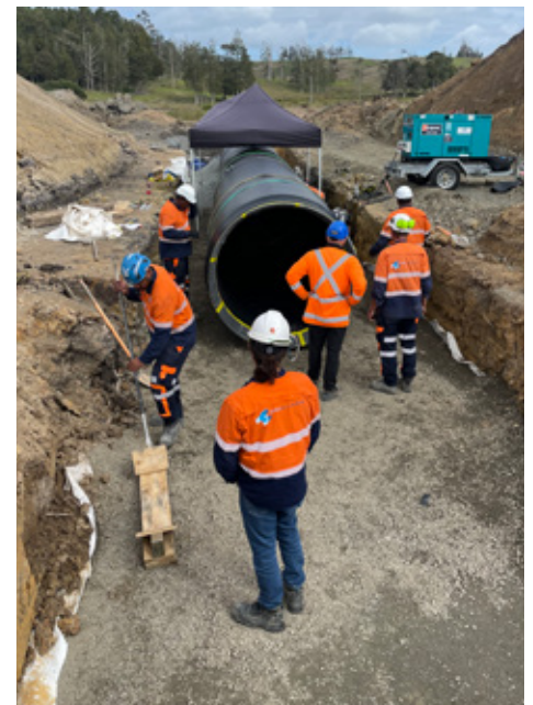
Replacing a culvert with a 22m long, 1.6m diameter pipe and rebuilding embankments south of Wellsford

As mentioned previously, we have also completed the upgrade of the track north of Whangārei, to Kauri, so it can take heavier trains. And we have almost completed changes at our Whangārei Rail Yard. These are predominantly track layout improvements, which will support carrying greater freight volumes, and drainage improvements to better manage flood risks at the yard.