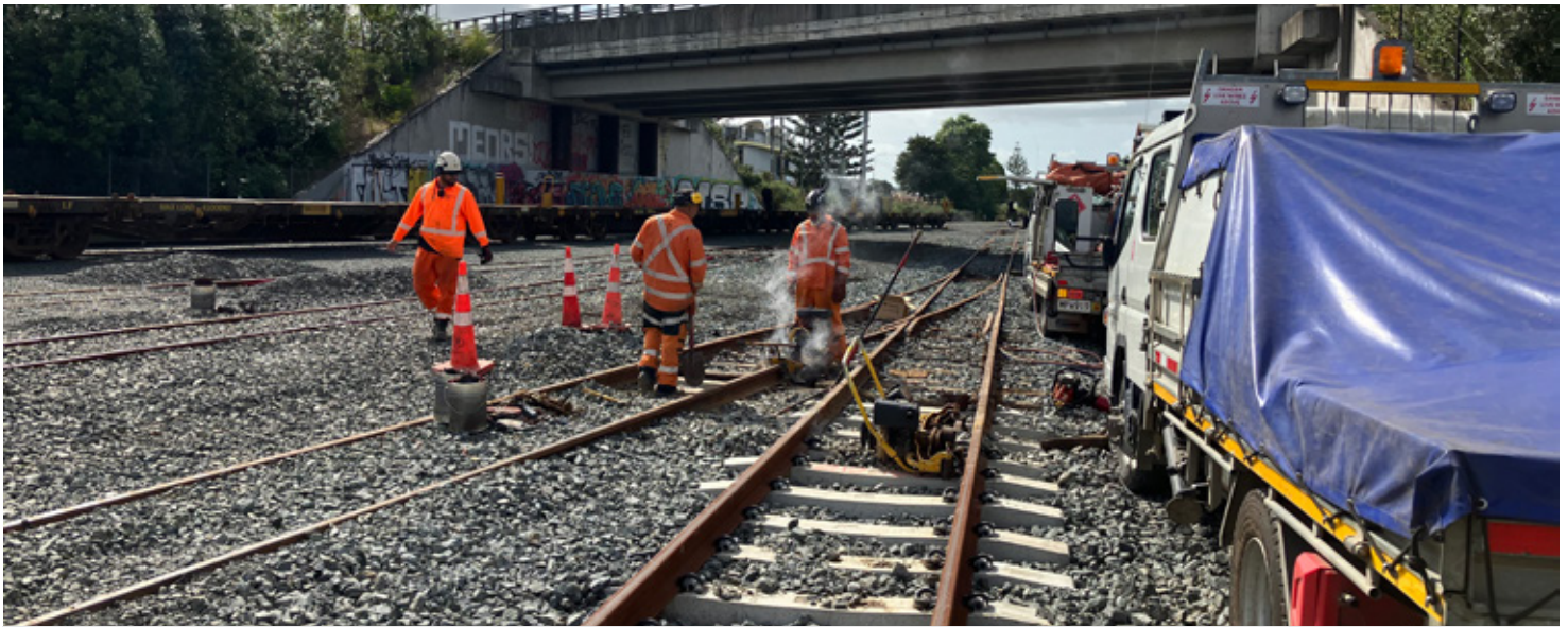
Sleeper replacement and track improvement work going on in the Whangārei Rail Yard