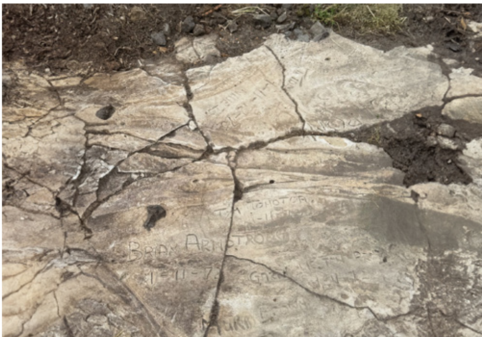
The inscribed grout slab