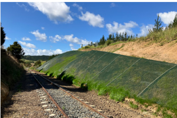
An embankment above the track which has been cleared, stabilised and hydroseeded near Topuni