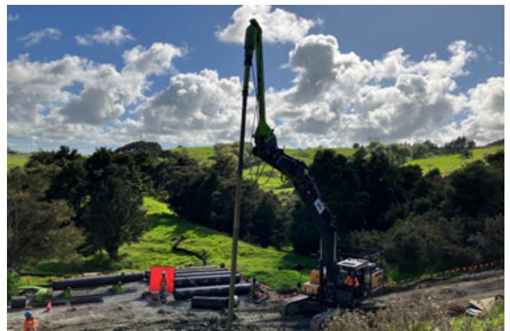
Piles, which are now filled with concrete, being installed to stabilise a steep embankment near Kaiwaka